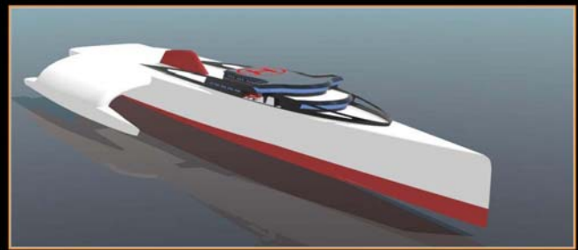
MIRCO ZOIA: Knud E.Hansen A/S - Athens, Greece

HYDRODYNAMIC OPTIMISATION OF A STABILIZED MONO-HULL CARGO VESSEL FOR HIGH SPEED SEA TRANSPORT