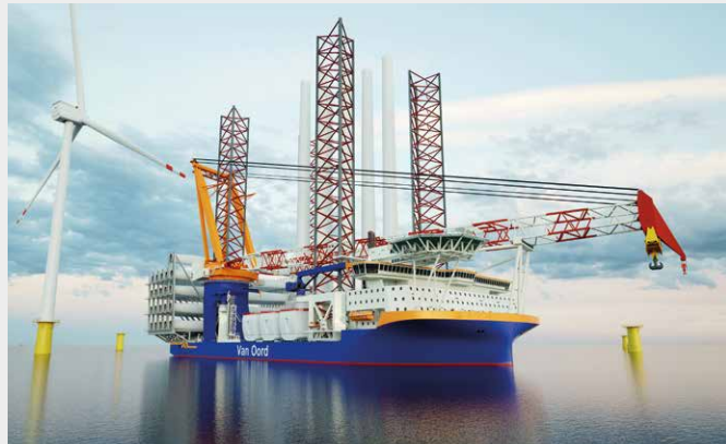
▼ 175m WTIV for Van Oord, based on the Atlas C-Class

The main crane can lift more than 3,000 tonnes and the four giant legs, each measuring 126 meters in length allow the vessel to be jacked up high above from waves in up to 70 meters water depth. The vessel is under construction and expected to enter the market in 2024.