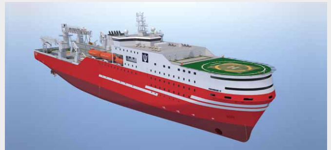
▲ 180 metre Accommodation Vessel Aquarius II

They can be designed to serve as an accommodation platform and remain alongside a wind turbine for an extended period of time or more as an in-field connector taking crews and equipment between accommodation vessels and the wind turbines.