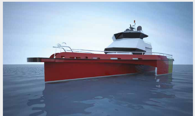
TRIWIND 24 m crew transport vessel ▲

The KNUD E. HANSEN developed TRIWIND concept is a trimaran with a long and slender fore body with accommodation astern in order to provide the best combination of passenger comfort, improved seakeeping and high-speed capability. The 24 meter vessel can accommodate 12 persons with a service speed of 25 knots. Optional ride control fins can be fitted for enhanced seakeeping performance.