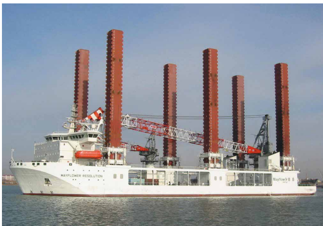
▲ World's first wind turbine installation vessel – TIV Resolution

KNUD E. HANSEN has been leading the world in the development of the offshore wind construction vessels. The company designed the world's first purpose built wind turbine installation vessel TIV Resolution back in 2001, when the offshore wind industry was just starting and it has now been operating successfully for over 20 years.