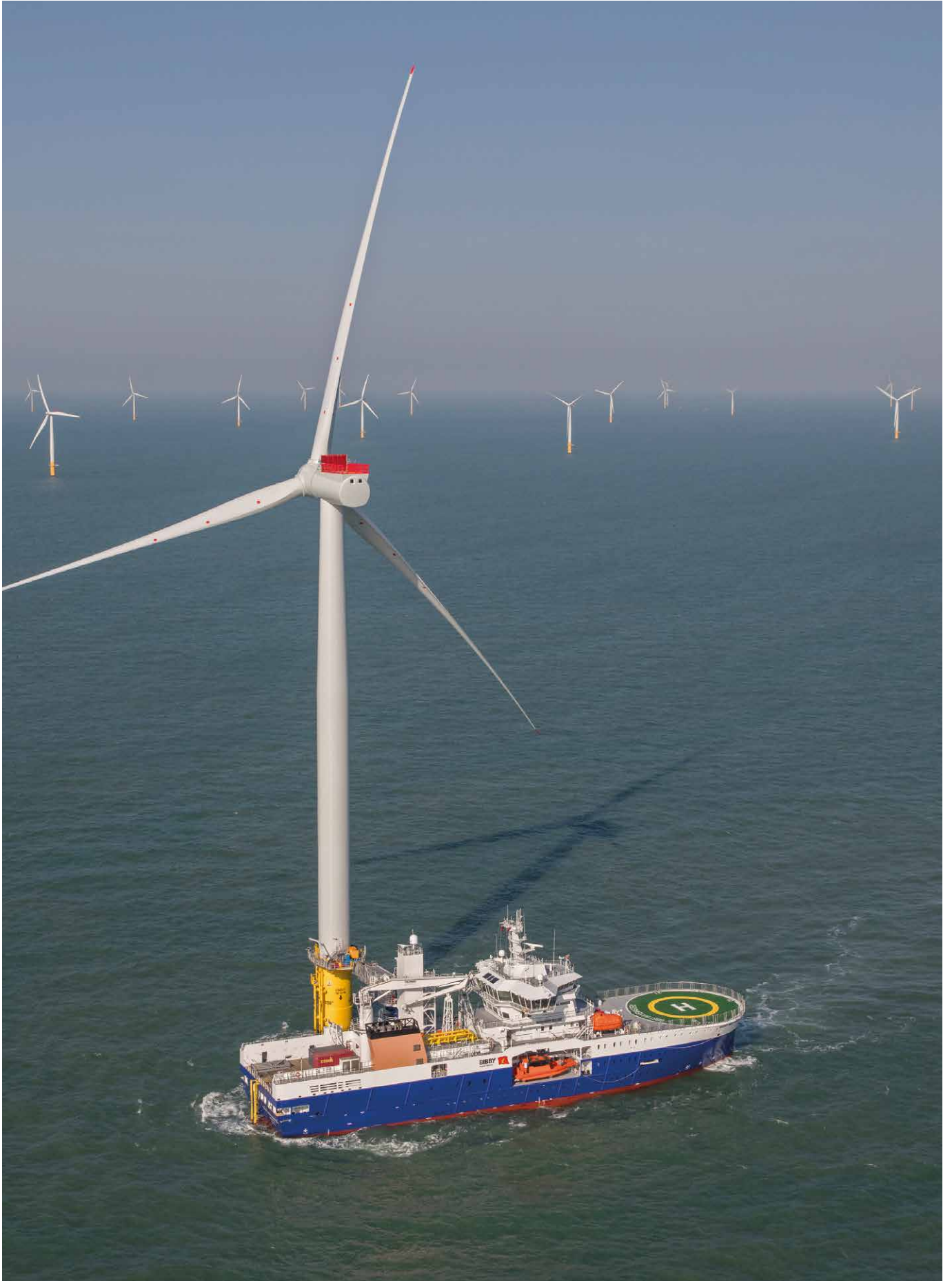
▲ 90 metre SOV Bibby Wavemaster