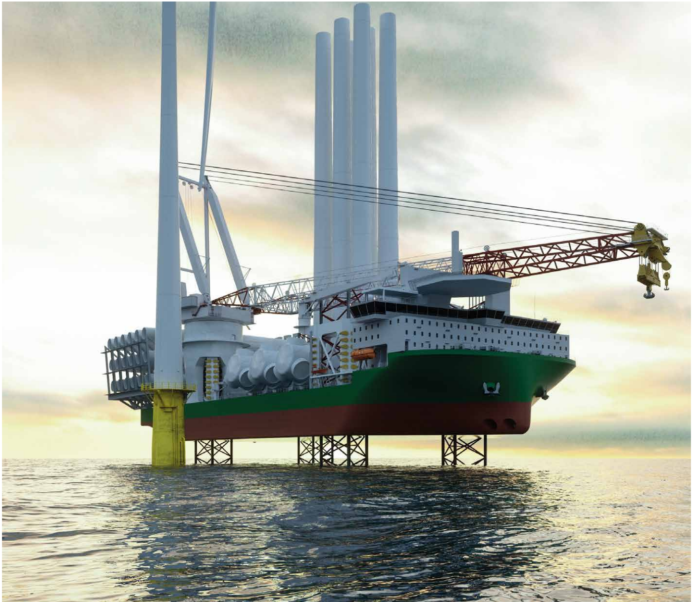
ATLAS A-Class, KNUD E. HANSEN'S WTIV platform ▲