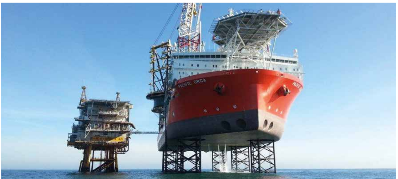
First of the giants – Pacific Orca ▼►

The ATLAS vessel designs are intended as a platform for further customization according to your objectives. Cranes, thrusters, generators and jacking systems can all be modified and selected from various suppliers and the vessel arrangement tailored to suit the individual needs of each client. This approach provides competitive advantages over other less flexible, off-the-shelf designs. ►►